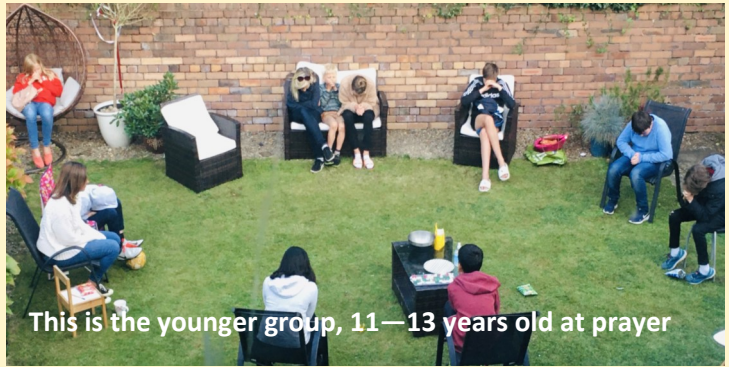
This is the younger group, 11—13 years old at prayer

Zoom was a very important tool in those early days in lockdown to stay in touch and check in with each other.