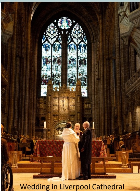
Wedding in Liverpool Cathedral

We are delighted to be part of this wonderful church here in Roath. This was the first church we visited back in August last year and totally fell in love with it.