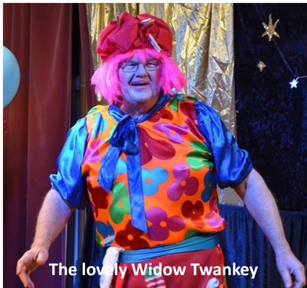
The lovely Widow Twankey