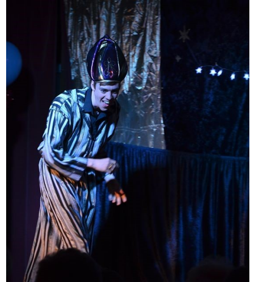
Abanazer in full flow