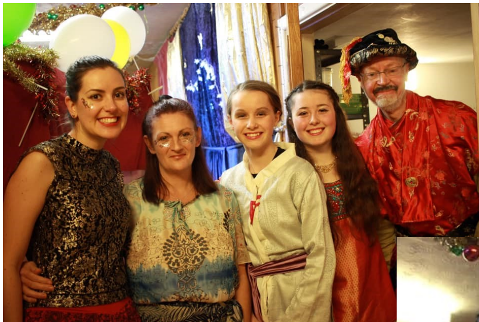
Aladdin @ Carols & Mince Pies