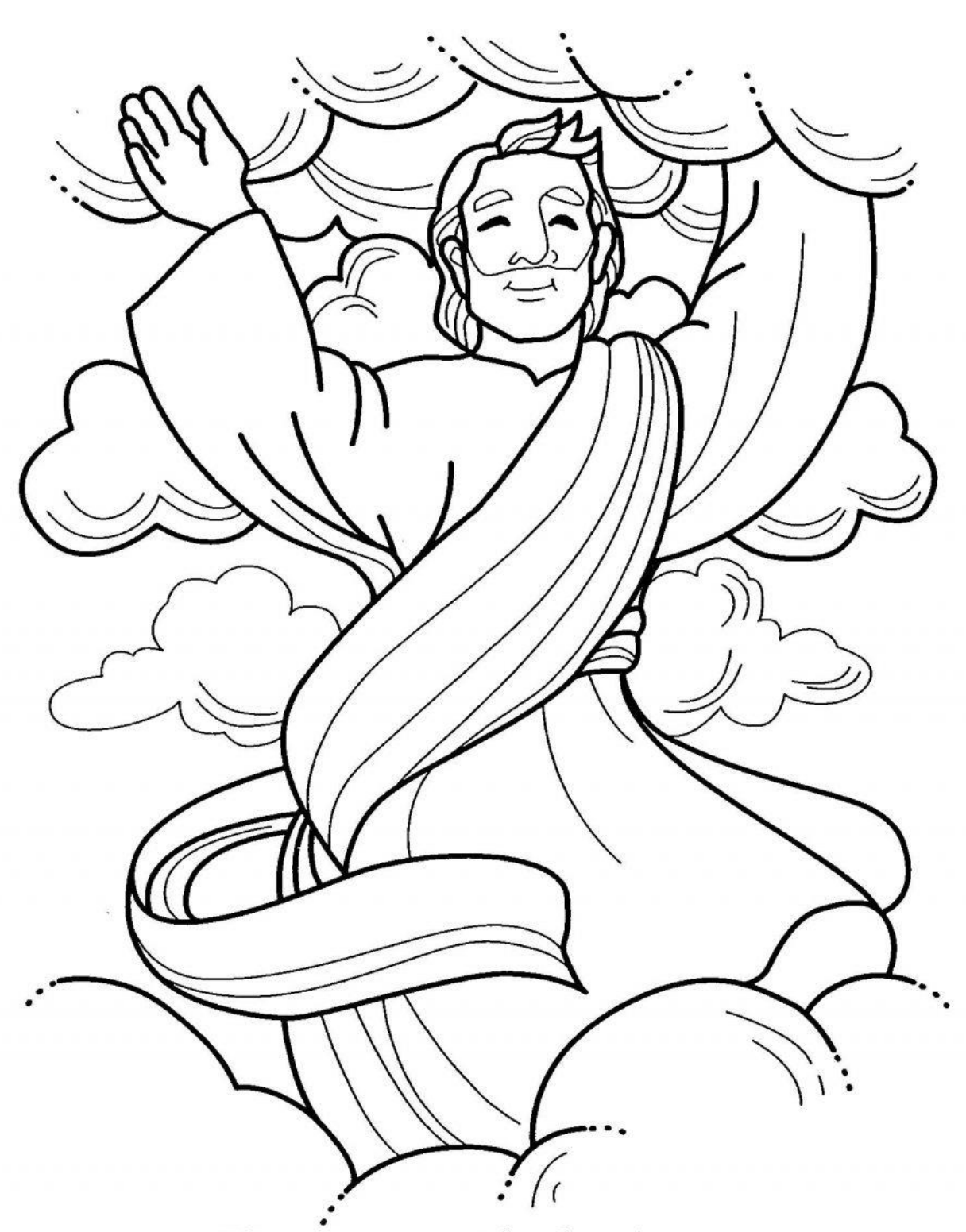
Then Jesus went back to heaven to make a home for his followers.