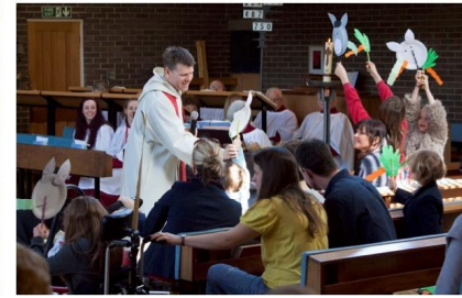
For details of our events and services, take a look at our website